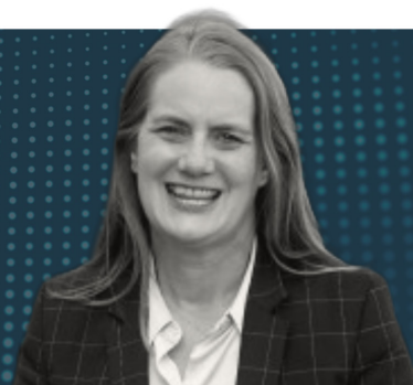
VIRGINIA CROSBIE Partner; & Former Member of Parliament